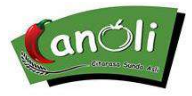
Fig. 1.2 Business Logo

The chili and tomato picture on the logo indicate that Canoli Restaurant uses good quality spices that can make the product more delicious. Then, the selection of green color is merely to make the logo look more eye-catching because the green and red colors of the chili look contrasting to attract the customer's attention. Next, the wheat image is chosen to decorate the logo so it does not look boring and ordinary. The words "Citarasa Sunda Asli" is displayed as a characteristic of Canoli Restaurant, considering this business is providing mostly Sundanese food. This logo was designed and chosen purely by the founder.