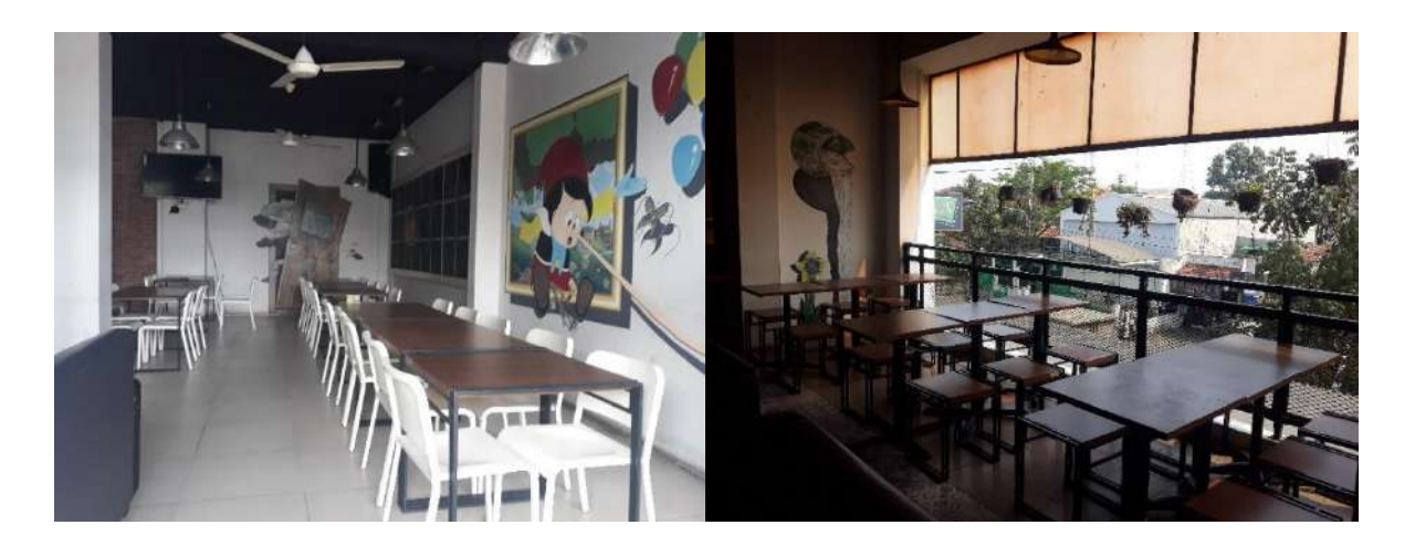
Fig. 1.1 Inner Part of Canoli Restaurant

Canoli Restaurant can accommodate up to 150 people. It will be useful when many customers are accidentally present at one time. With the large capacity, customers can still enjoy the place and food without having to queue or wait, considering the long queue will disappoint customers and become a minus point for this restaurant. A spacious place like this can also help when there are customers who want to rent a place for an event such as, a birthday or other celebrations. With this, customers can invite lots of acquaintances and do not have to worry about a narrow space.